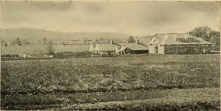
THE COLLEGE BARNS

The Massachusetts Agricultural College is endowed by the Federal government and by the State of Massachusetts for teaching and investigation in agriculture in the broadest sense. The College has a farm of over 500 acres in a high state of cultivation, and illustrates all the leading agricultural industries of Massachusetts and some of the best agricultural specialties. There is a large new range of greenhouses of the most modern and approved type just completed within the past year; there is a modern dairy barn with dairy cattle; there are good horses, pure-bred swine, sheep and poultry;